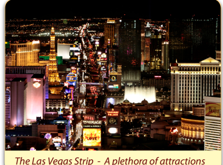
Conference Location and Accommodation

As one of the world's busiest tourist destinations, the city of Las Vegas offers just about everything – spectacular shows, shops and restaurants, theme park attractions, and the natural beauty of the surrounding lakes, parks and canyons.